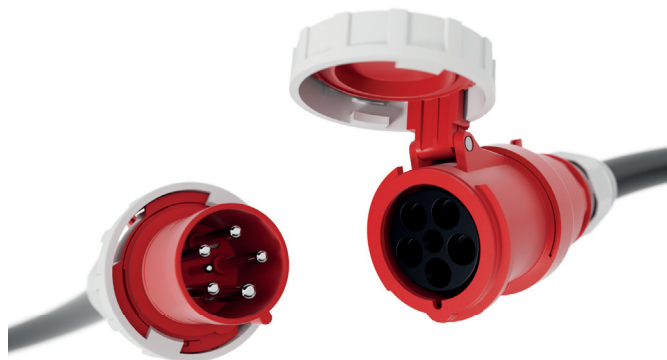
KONTEX-ULTRA available in versions from 63 to 125A.