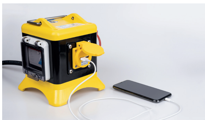
Perfect optical integration in a BALS Uni-Block.